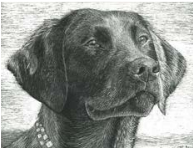
"A Loyal Hunter," Our 2022 Winner

The Artistic Discovery Contest is open to all high school students in our district. The winning artwork of our district's competition will be displayed for one year in the U.S. Capitol. The exhibit in Washington will include the winning artwork from all participating districts from around the country. The winning artwork is also featured on House.gov's Congressional Art Competition page.