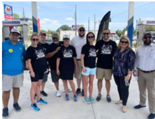
Rep. Cammack Spends Time With Constituents Across Florida's Third Congressional District