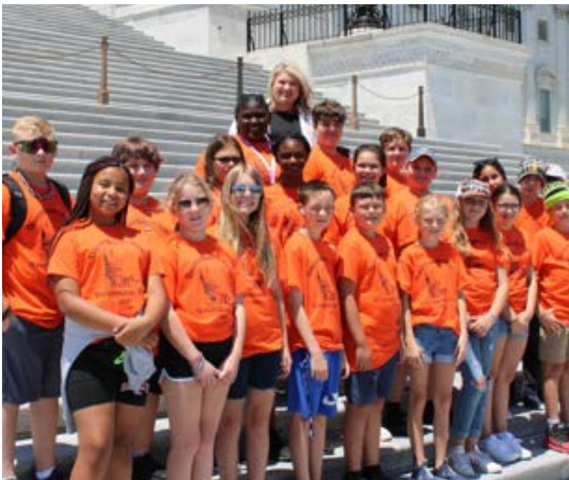
Rep. Cammack Greet Students From Florida's Third On U.S. Capitol Steps

Please check out the "Tours and Tickets" tab on our website for more information.