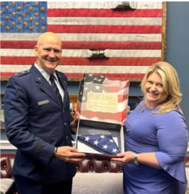
Rep. Cammack Presents U.S. Capitol Flag To Florida National Guard's Adjutant General Eifert

Flags are available in different sizes and fabrics. All flag purchases include a dedication message, which may be customized for the recipient. You may choose to have your new flag flown over the U.S. Capitol for an additional charge. Flags flown over the Capitol include a certificate, which may be personalized for a particular person, event, or organization.