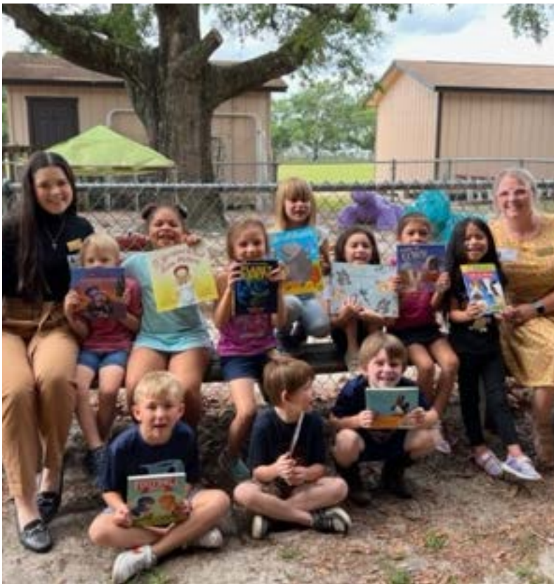
Members Of Our Team Delivering Books From Library Of Congress To FL-03 Elementary Schools

Schools and teachers in Florida's Third Congressional District interested in partnering with us on this initiative can learn more on our website under the "Read to Lead" Book Program tab.