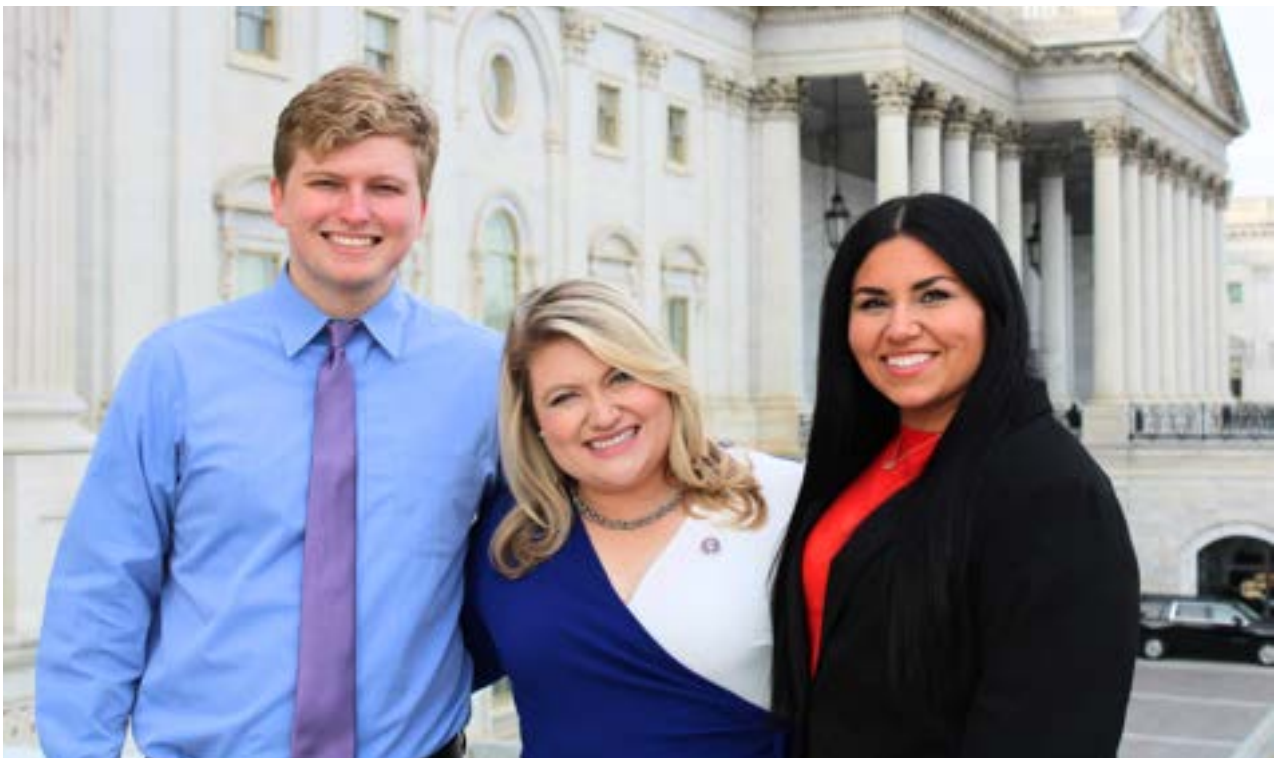
Congresswoman Cammack With Fall 2022, Washington D.C. Interns

Interested candidates can apply on our website under the "Internships" tab.