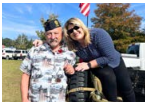
Rep. Cammack Meets With Local FL-03 Veterans

The Supplemental Security Income (SSI) program provides monthly payments to adults and children with a disability or blindness who have income below specific financial limits. SSI payments are also made to people age 65 and older without disabilities who meet the financial qualifications.