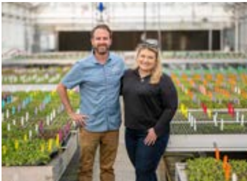
Rep. Cammack Tours Agriculture Facilities Throughout Florida Ahead Of Farm Bill

SELECT SUBCOMMITTEE ON THE WEAPONIZATION OF THE FEDERAL GOVERNMENT