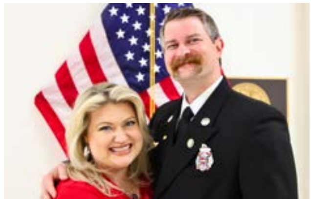
Rep. Cammack With Husband Matt At The 2023 State Of The Union Address